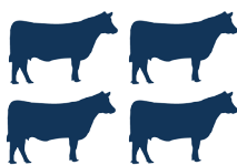
Each cow icon = 50 cows

82% of ranchers in California have herds with less than 200 cows